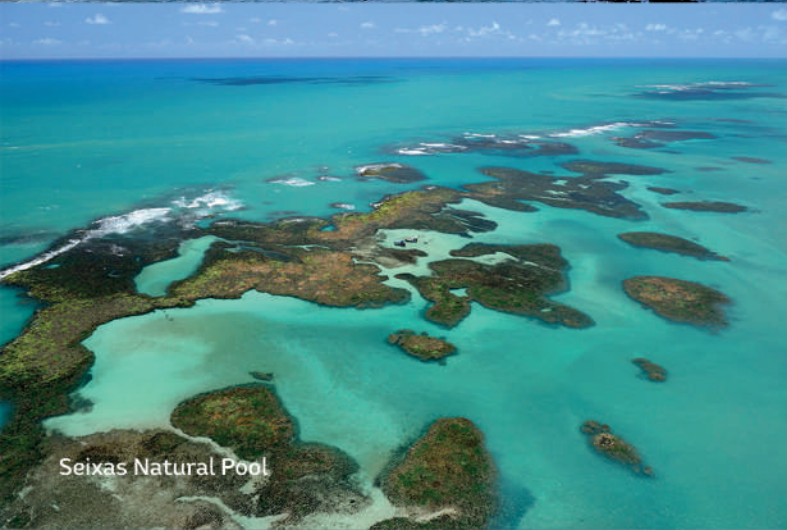
Seixas Natural Pool