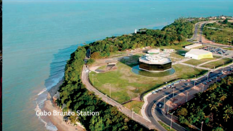
Cabo Branco Station